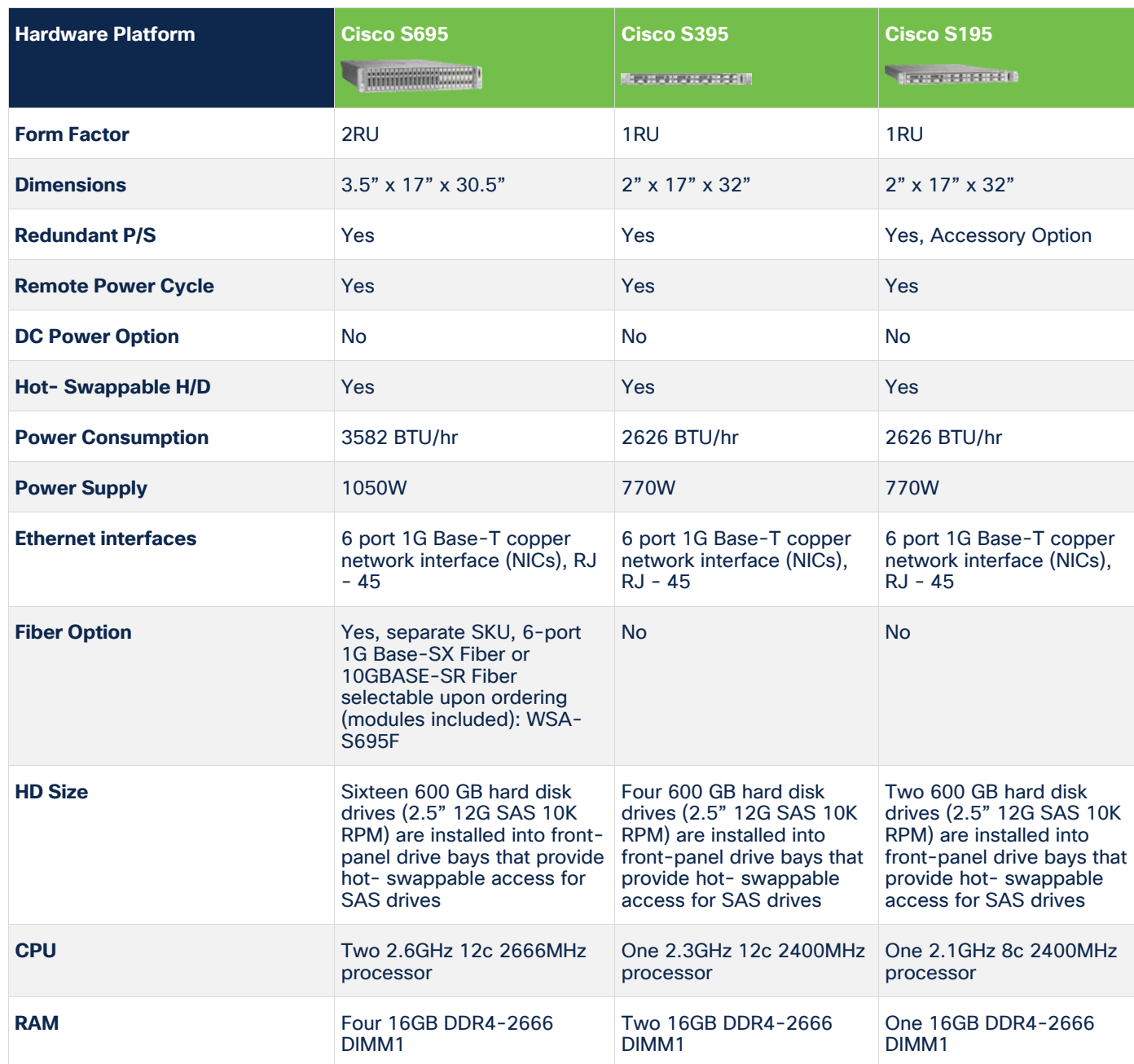
Table 2. Secure Web Appliance hardware specifications